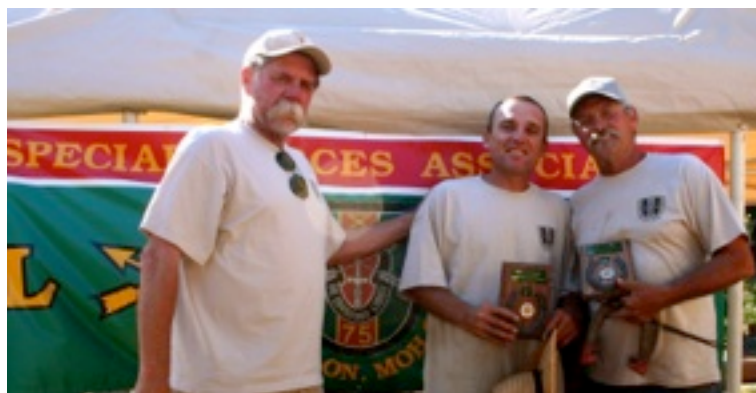
3rd ANNUAL SF HORSESHOE TOURNAMENT