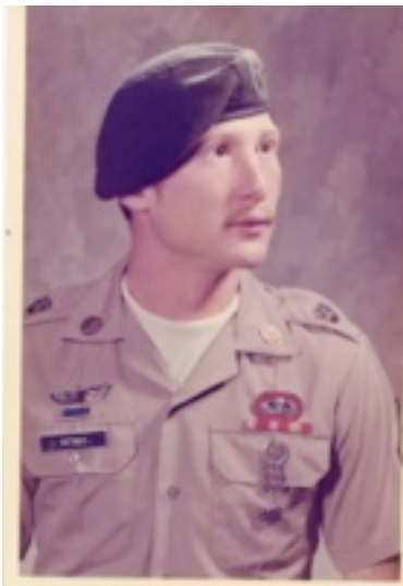
From little acorns grow mighty oaks