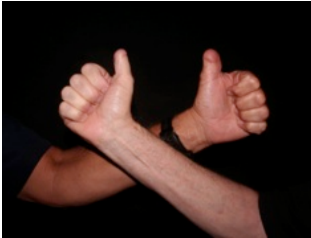
THE STUMP BROTHERS

“Do you know these two Chapter 75 members?”