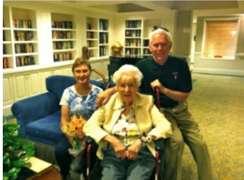
THE REGIMENT'S FIRST LADY

“Do you know these two Chapter 75 members?”